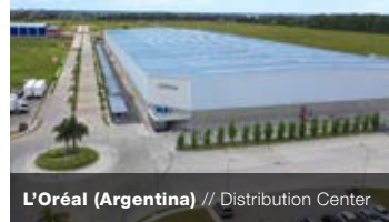
L'Oréal (Argentina) // Distribution Center