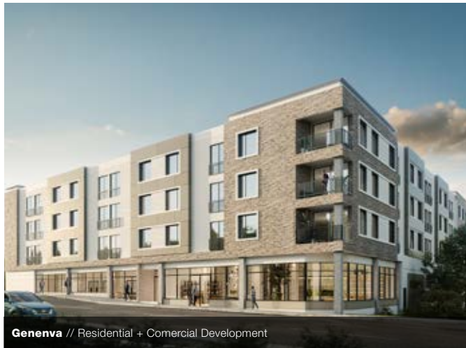
Generva // Residential + Comercial Development